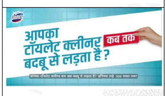
जिताहें) हिताह 11 हामारण त्यंतिर क्लीनर कर तक बद्द से सदता है? क्लेक्स लड़े 100 प्रत्स तक!