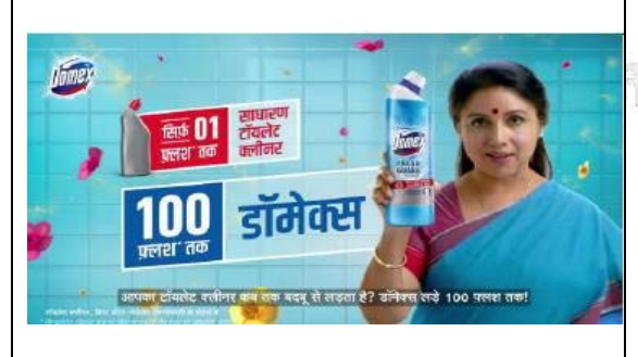
VO: Domex Ladhe 100 flushtak!

Disclaimer: Toilet cleaner, bina waterrepellent technology ke sandharbha main Simulated toilet per kiye gaye swatantra lab test par aadharit, 2021