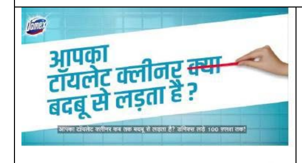
VO: Aapka toilet cleaner kabtak badboo se ladhata hai?